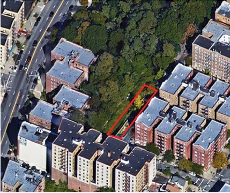
Aerial, 1-15 Wadsworth Terrace – Manhattan, NY